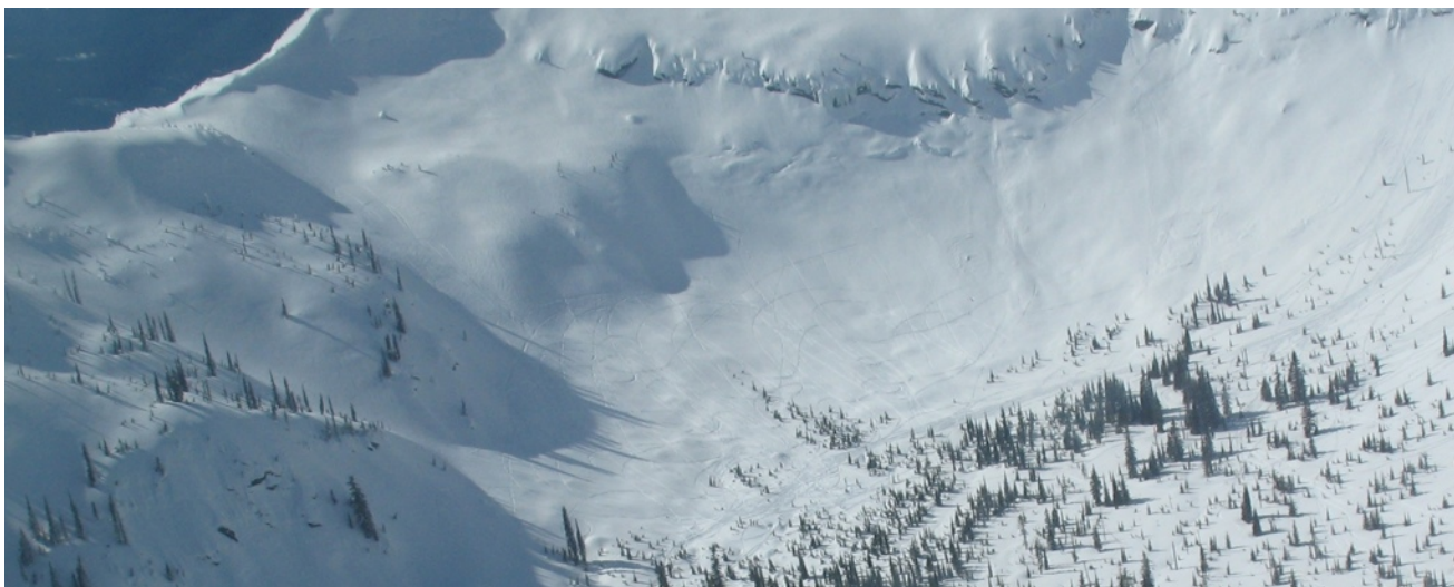
Figure 1 Snowmobile tracks within south end of Cow Creek.