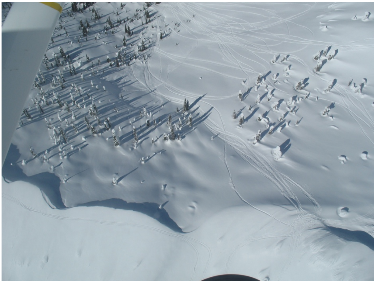
Figure 2 Snowmobile tracks in closure within upper portion of Grass Creek drainage.