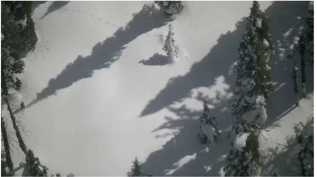
Figure 3 Wolverine tracks located within vicinity of Hidden Lake.